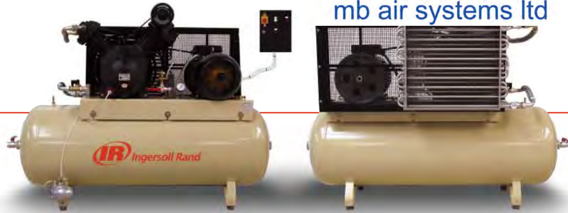
Premium Range Illustrated

11 bar receiver mounted, 14 bar base mounted.