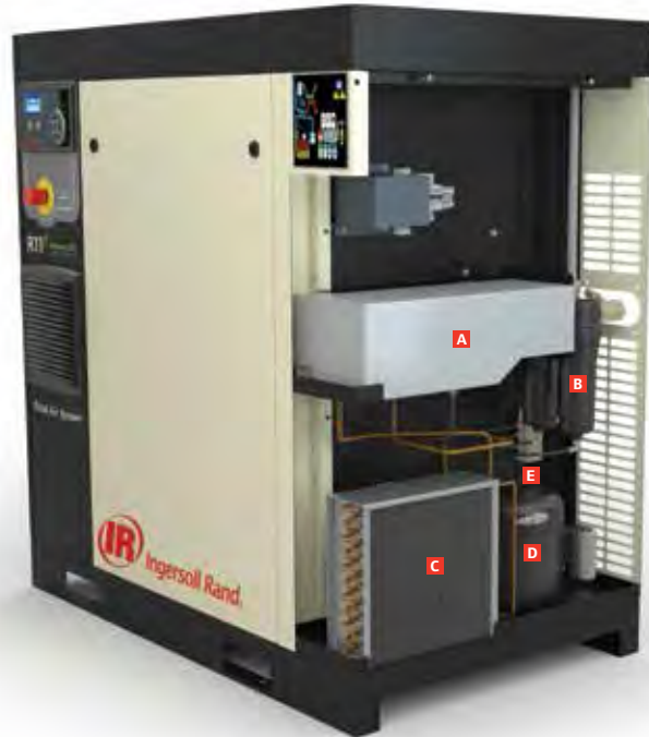
TAS (Total Air System)