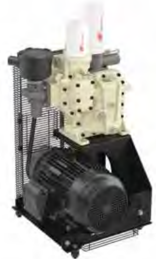
Vertically-stacked drive components reduce overall footprint by 20%.