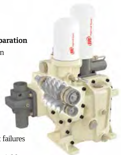
The all-in-one CE55X airend features improved air/oil separation and reliability.